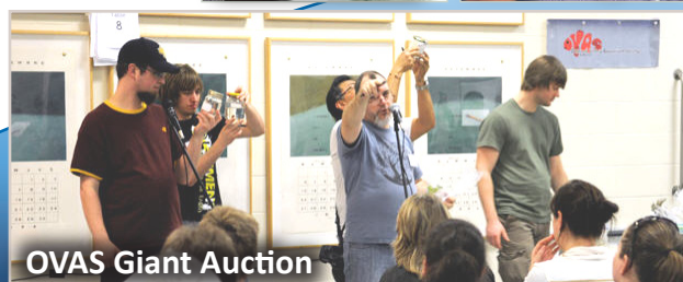
OVAS Giant Auction